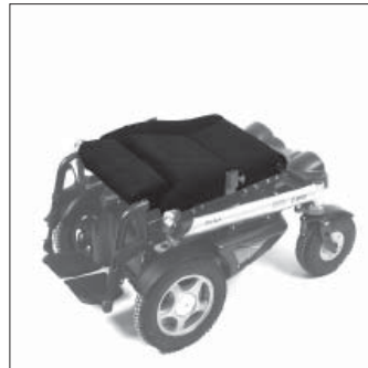
Seat module W