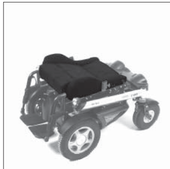
Seat module X