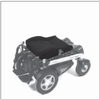
Seat module F