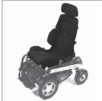
Back rest LT