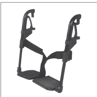
Individual foot rests