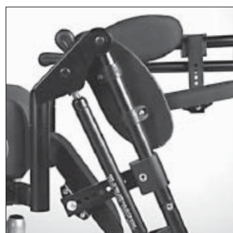
Elevating foot rest