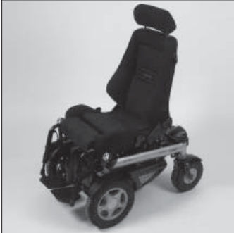
Back rest LX