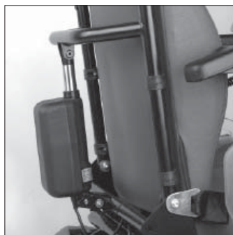
Electric back angle adjustment