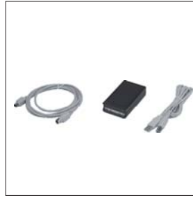
IR receiver mouse emulation