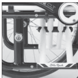
Fixed welded version