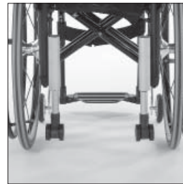
MA50 Transport wheels