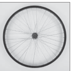
MG 06 Hollow rim