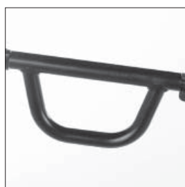
MB 06 Tube foot rest