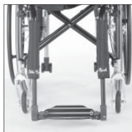
MA 60 Frame pad