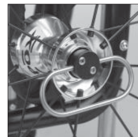
MG 28 Tetra release