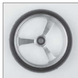
MF 37 6" Froglegs soft caster