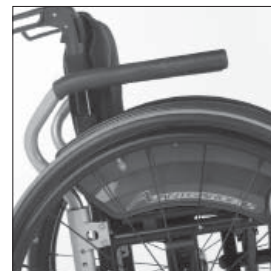
ME 50 Padded arm rests