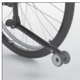
MA 55/56 Anti-tipper