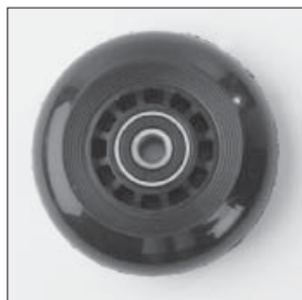
MF 01 3" skater caster