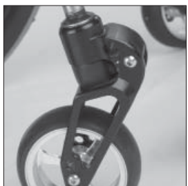
MX 30 Froglegs suspension fork