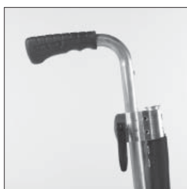
MD 55 Fold-down push handles, height-adjustable