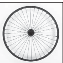
MG 16 BOR lightweight rim