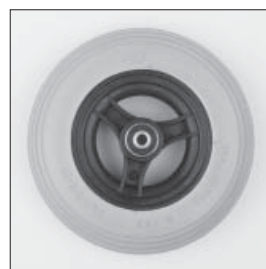
MF 08 7" solid rubber caster