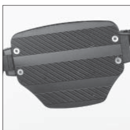
MB 03 Single-panel foot rest