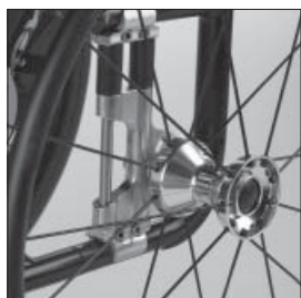
MG 97 - 99 Shock absorber