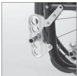
MG 86 Wheelbase extension