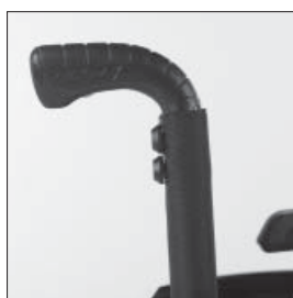
MD 50 Fixed push handles