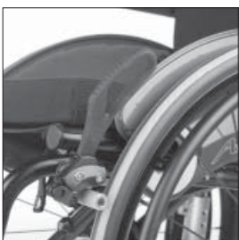
MH 10 Wheel lock lever extension