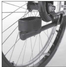
MA 57/58 Crutch holder