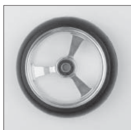
MF 36 5" Froglegs soft caster