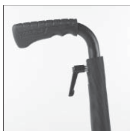
MD 52 Telescoping push handles