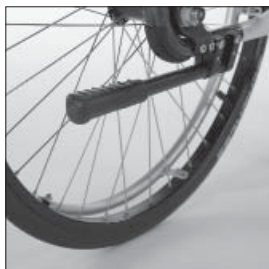
MA 51/52 Tip-assist