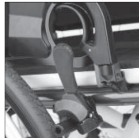
MH 01 Knee lever wheel lock, folding