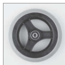
MF 06 6" solid rubber caster