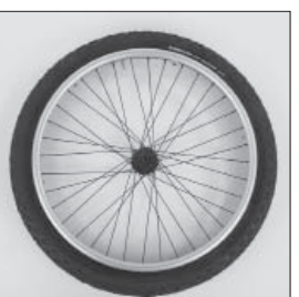
MG 14 Mountain bike wheel