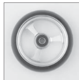
MF 35 4" Froglegs soft caster