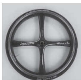
MX 21 Xentis Kappa carbon wheel