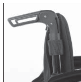
MD 56 Fold-down push handles