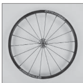
MG 10 Spinerger SPOX