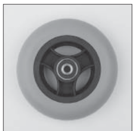
MF 03 5" solid rubber caster