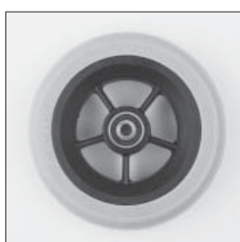
MF 04 5.5" soft caster