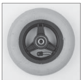
MF 05 6" pneumatic caster