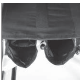
MC 15 Business upholstery