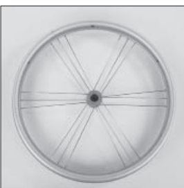
MG 12/13 Hurricane rim