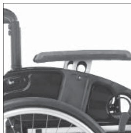
ME 06 Side panels with arm rest