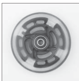
MF 21 4" luminous caster