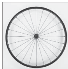
MG 15 Infinity Ultralight