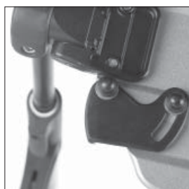
MB 73 Adjustable lateral heel blocks