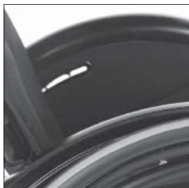
ME 02 Clothing protector