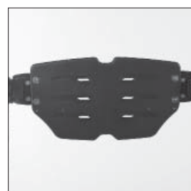
MB 08 Anti-skid foot plate