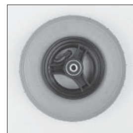
MF 07 7" pneumatic caster