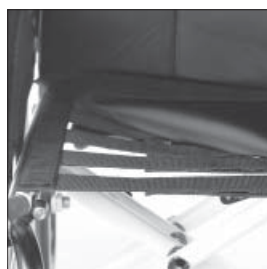
MC 14 Adaptable upholstery