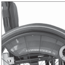
ME 01 Standard side panels