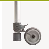
6265E Swivel wheels with push down brake.