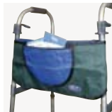
6015 Pouch - Brio only.