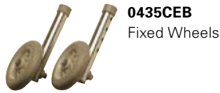
0435CEB Fixed Wheels

A medium size domestic aluminium frame which is height adjustable. Wheel kit also available.